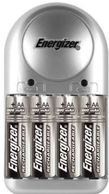
Best used with Energizer® NiMH batteries